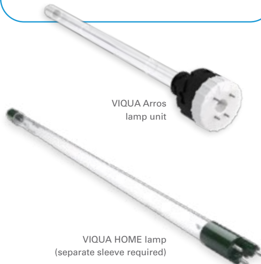
VIQUA Arros lamp unit

Only use a VIQUA lamp in VIQUA HOME systems and a VIQUA single-component lamp and sleeve in VIQUA Arros™ systems. Using a non-VIQUA lamp could impact system performance, and it voids all system certifications, which impacts system warranty.